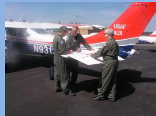
Planning a CAP Mission

In 1976, the Air Force reassigned the Headquarters Civil Air Patrol (HQ CAP-USAF) from the inactivating Headquarters Command, USAF, to Air University on 1 July 1976. The HQ CAP-USAF is the Air Force oversight organization for the Civil Air Patrol, the official Air Force civilian auxiliary. Because of the growth of its emergency services mission, the Air Force transferred HQ CAP-USAF to First Air Force, Air Combat Command, Tyndall AFB, Florida on 1 June 2016.