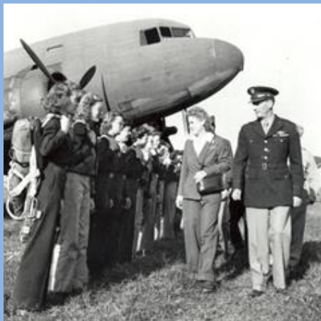
Jacqueline Cochran, Chief of the WASP, inspects women pilots at Maxwell

Maxwell Field, like other AAF installations, had its own segregated African American unit, the 4th Aviation Squadron, established on 10 June 1941. Located near the Alabama River on the north edge of Maxwell Field, the present site of the federal prison camp, this segregated squadron had its own facilities. Although its official mission was stated as “security,” the squadron’s primary duties consisted of service as buglers, custodians, chauffeurs, drummers, foot messengers, hospital and mess hall attendants, military police, and truck drivers. Nearby Gunter Field had the 22d Aviation Squadron for the same general duties.