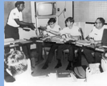
Air Force SNCO Academy Seminar at Gunter Annex

The vision of the Secretary of the Air Force Donald B. Rice and the Chief of Staff of the Air Force General Merrill A. McPeak vision of an Air Force office to inculcate the principles of total quality management across the Air Force (later the Quality Air Force (QAF)) led to the establishment of the Air Force Quality Center on 1 August 1991 under AU at Maxwell. The center provided the Air Force with the concepts, methods, tools, and advice to aid the Air Force to attain a "quality" culture through education programs, consulting services, training resource materials, and related research and analysis.