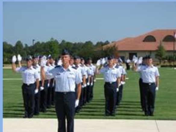
Commissioning Ceremony at Officer Training School

In 2006-2007, AU's structure and program effectiveness underwent an in-depth review that led to major changes in AU's structure. In April-July 2008, the Air Force activated the Carl Spaatz Center for Officer Education with AWC, ACSC, SOC and SAASS as subordinate units. It also redesignated the College of Enlisted Professional Military Education as the Thomas E. Barnes Center for Enlisted Education with the Community College of the Air Force (CCAF), the Air Force Senior Noncommissioned Officer Academy, and the First Sergeants Academy as subordinate units. The Air Force Doctrine Development & Education Center became the Curtis LeMay Center for Doctrine Development & Education, and Air Force Officer Accessions and Training School became the Jeanne M. Holm Center for Officer Accession and Citizen Development. AU also created the Air Force Research Institute to provide independent analysis and scholarship in support of the Air Force's mission and contribution to national security.